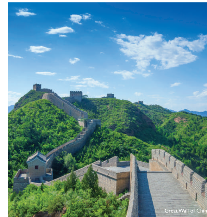
Great Wall of China

Tour Price Includes: Domestic China Airfare, Meals, Tours, Guides and Hotels