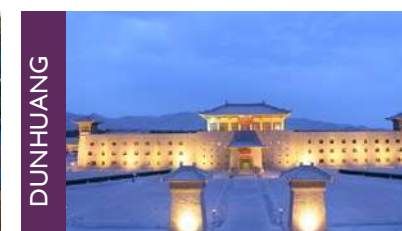
Silk Road Dunhuang