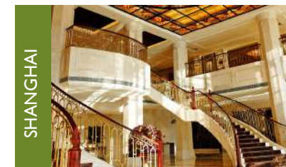
Sunrise on the Bund