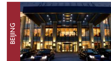
Courtyard Beijing Northeast

www.chinadiscoverytours.com/CD/hotel.html