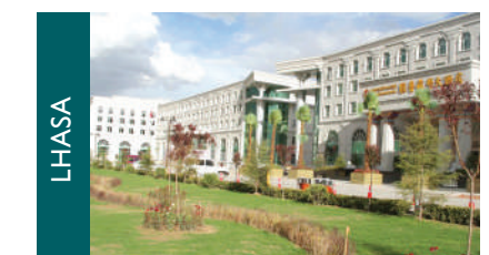
Brahmaputra Grand Hotel