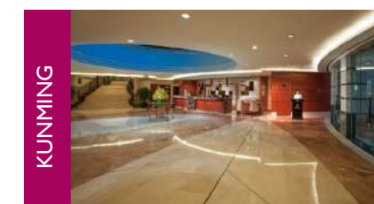
Grand Park Hotel