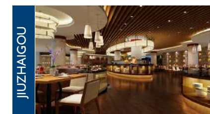
Howard Johnson Resort