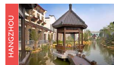
Sheraton Wetland Park Resort