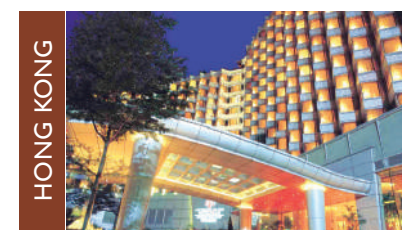
Harbour Plaza Metropolis