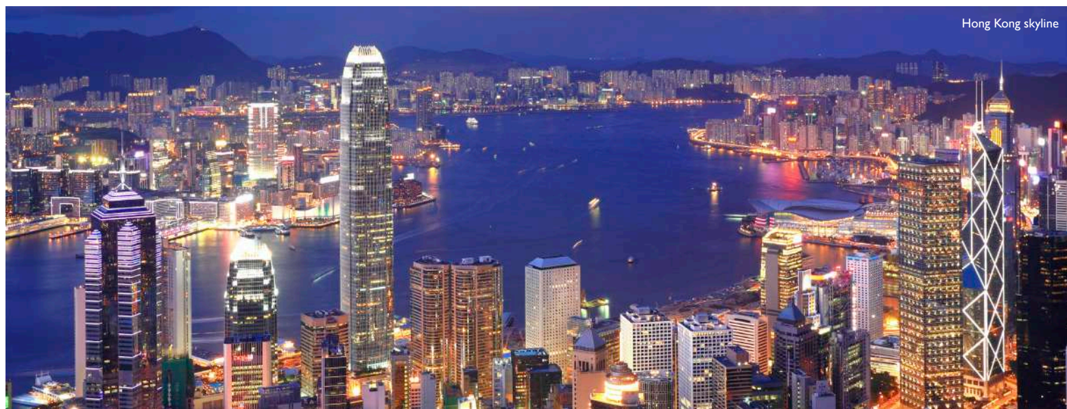
Hong Kong skyline